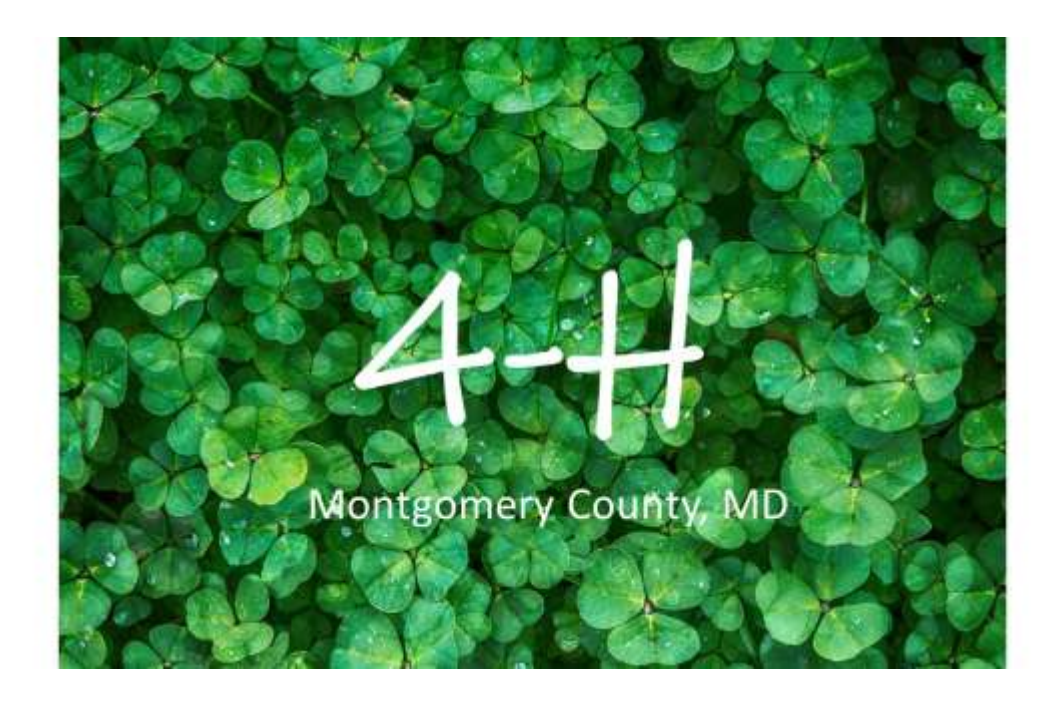
September 1, 2024