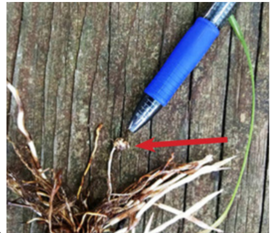
Photo 1: Yellow nutsedge primarily reproduces by tubers.

As a result of this misconception, yellow nutsedge can be difficult to control with approaches that are better suited for grasses. In this, some agricultural circles see yellow nutsedge as a serious challenge to weed control in crop production. The sedge family is quite large with some 5,500 known species distributed across the globe. Though we are most often faced with yellow nutsedge in the Mid-Atlantic, with purple nutsedge being commonly found in the Southeastern United States.