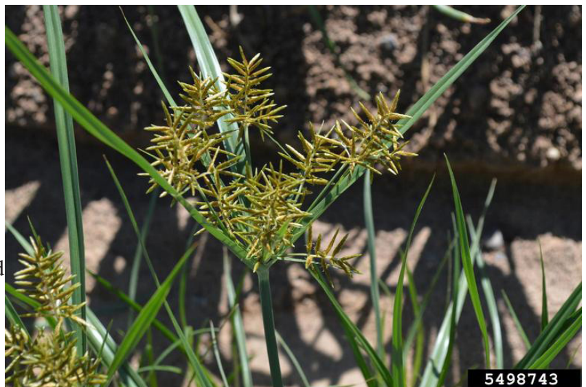
Yellow nutsedge seed head.