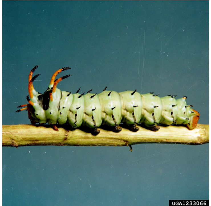
Hickory horned devil caterpillars look menacing, but they are not.