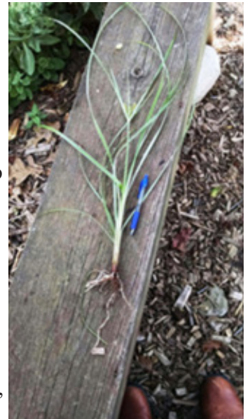
Photo 2: Yellow nutsedge overall plant.

When controlling yellow nutsedge in turf, always remember the following 5 points. 1) Follow label directions exactly. 2) Do not mow turf 2 days prior to application of the herbicide. 3) Use the proper volume of water and do not apply when the turf is stressed. 4) Be cautious near transitions of turf to ornamental beds as some herbicides can cause damage to desired ornamentals. And lastly but not the least is 5) Repeat application according to label instructions.