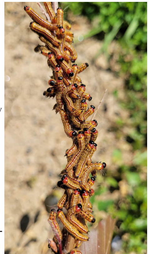
These yellow-necked caterpillars are clustered and feeding along this beech stem.

Marie Rojas, IPM Scout, found yellow-necked caterpillars feeding gregariously on Fagus sylvatica 'Riversii'. This caterpillar feeds on a variety of woody plants. We will see activity into October. There are predators and parasitoids, including tachinid flies that prey on these caterpillars.