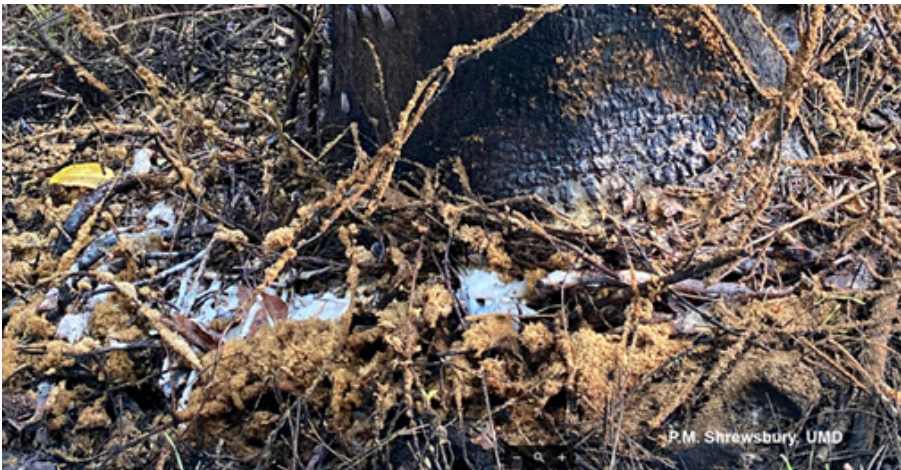
Base of a tree-of-heaven with high densities of SLF adults showing fermenting honeydew, black sooty mold, and a tan sooty mold fungus that I have seen for the first time associated with SLF honeydew.

If you see SLF egg masses , please contact Stanton Gill ( sgill@umd.edu ) and me ( pshrewsbury@umd.edu ) and let us know where and on what host / structure you see the egg masses.