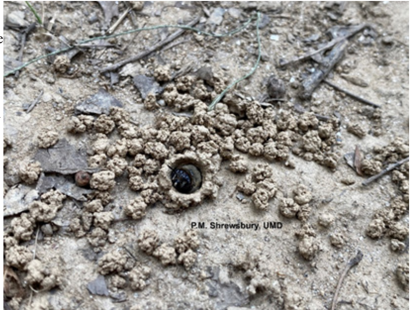
Ptilothrix bombiformis bee with its head sticking out of its nest opening. Note the mud turret and pellets which were created when removing soil from its nest gallery.

soil so the bee can excavate its burrow, which usually has one to two cells (each cell will support a bee larva) in it. In building her soil gallery, Ptilothrix creates small balls of soil, using the water she imbibed, which she rolls out of the gallery using her hind legs. Characteristic to this species are mud turrets at the top of the entry hole and numerous small “mud pellets” of soil around the hole. A female Ptilothrix can make several nests in a season. Although Ptilothrix is a solitary bee, it is common to find aggregations of Ptilothrix in the same area.