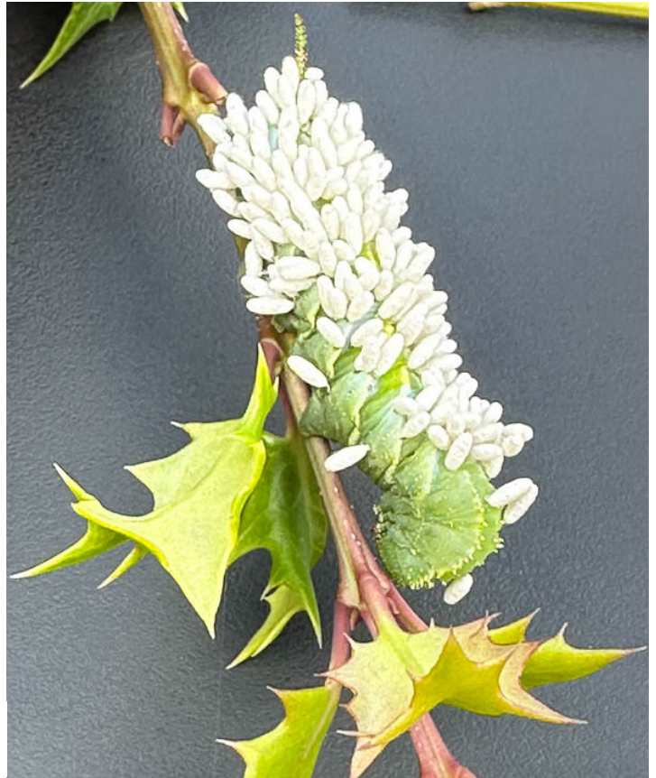
These wasp cocoons are a parasitoid of caterpillars.

With all of the caterpillars active this late summer, it is good to know there are ichneumon wasps that will parasitize some of the caterpillars. Chris Kanarr found these pupal cases of the wasp that parasitizes the caterpillar.