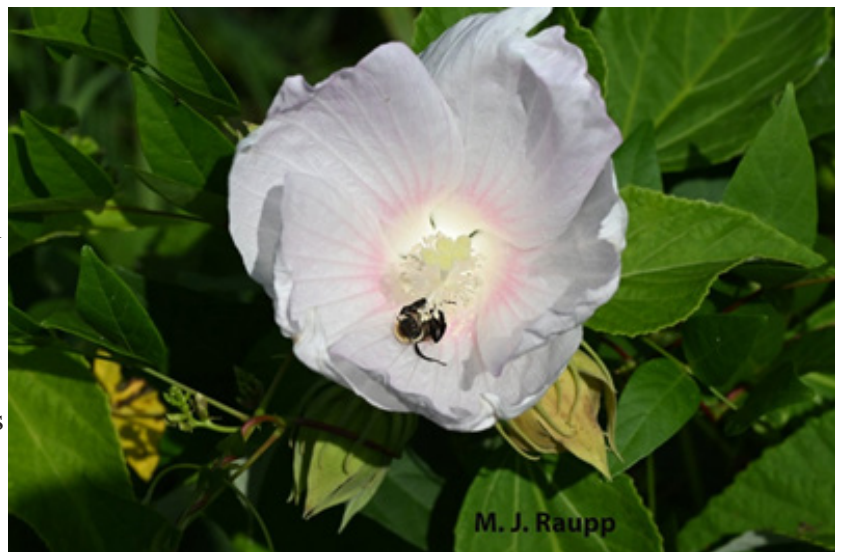
A Ptilothrix bombiformis bee foraging in a marsh mallow flower for resources to bring to its nest for its young.