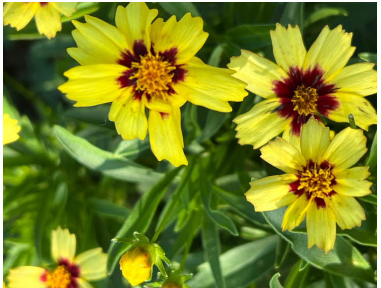
Coreopsis grandiflora 'Sunfire' is compact cultivar of native tickseed.