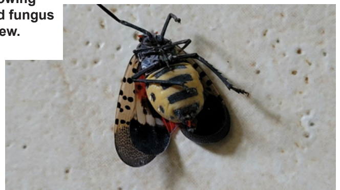
Spotted lanternfly female with her abdomen swollen and full of eggs.