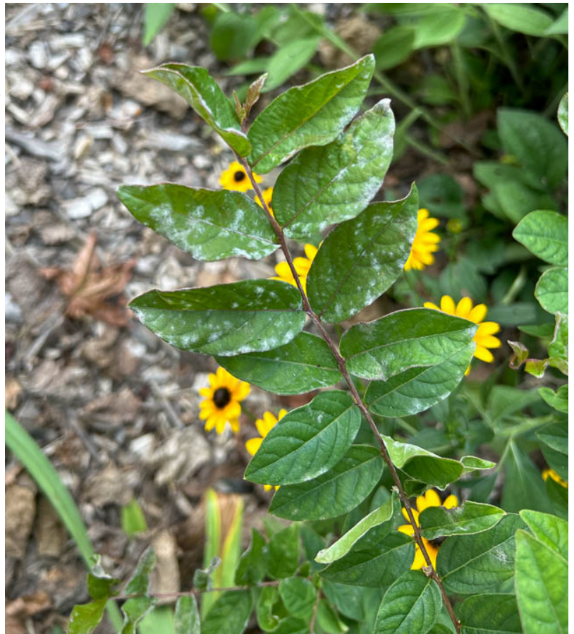
Powdery mildew infection on a crape myrtle.

Stephen Beegle found powdery mildew infecting crape myrtle in Crofton this week. Sunny days and cool nights provide optimal humidity conditions around the leaves for powdery mildew infection.