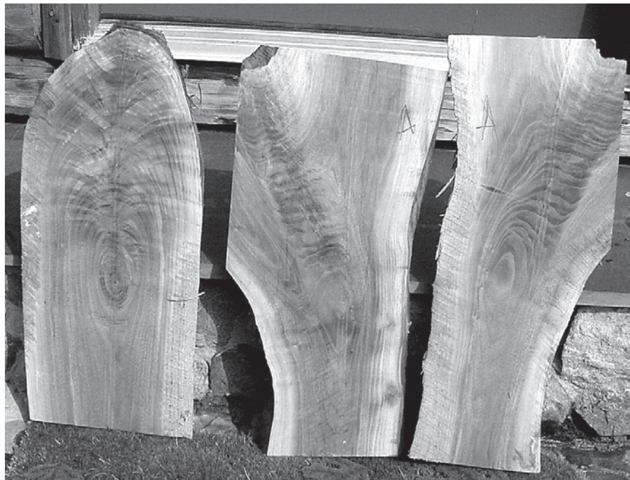
Specialty cuts such as the burl on the left and book-matched black cherry pieces on the right may be cut from a log not useful for traditional dimension lumber.

A bit of sage advice shared by experienced owner-operators is, “ Don’t expect to be able to outcompete prices offered by retail lumber dealers. ” If you are to stay in business and make a profit, you must be able to offer something that your competition (retailers or other portable sawmill owners) can’t. Find your