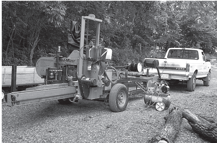
When you buy a mill, you'll have to decide whether to get the trailer package. The ability to bring the mill to the site is a major appeal to many customers.

Some manufacturers sell their mills as stationary units without the trailer package for buyers who are not interested in a portable feature. Are you going to custom-saw at a base site or be a portable operation going to various sites? This decision will influence whether or not you'll need the trailer package. These mills pull very easily and can be set up quickly on reasonably level ground. The ability to bring the mill to the site is a major appeal to most customers. The