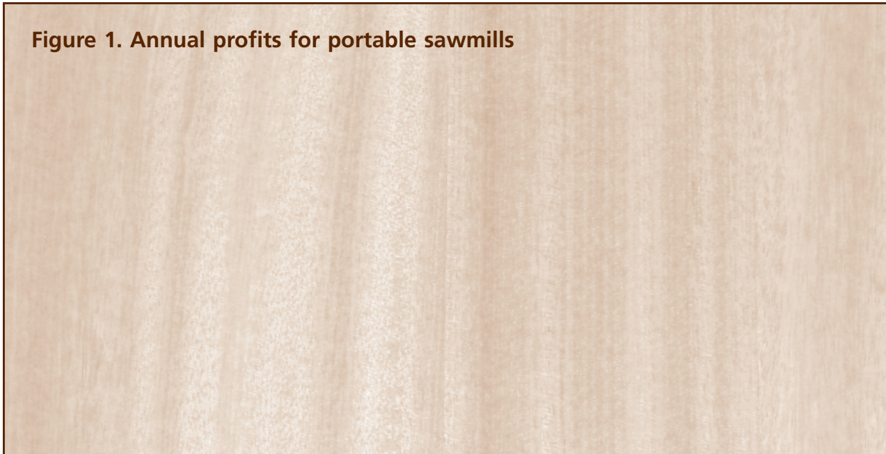
Figure 1. Annual profits for portable sawmills

Based on these results, it appears that a prospective owner-operator of a portable sawmill might well consider buying either a small unit with low daily output and a relatively low initial cost, or a fairly large unit that is more mechanized and can produce much more lumber than a small unit. But if the operator of the medium mill didn’t hire an assistant the profit margin would improve substantially (even in consideration of reduced production rate). With the larger unit the operator would most likely require an additional person to help to optimize production