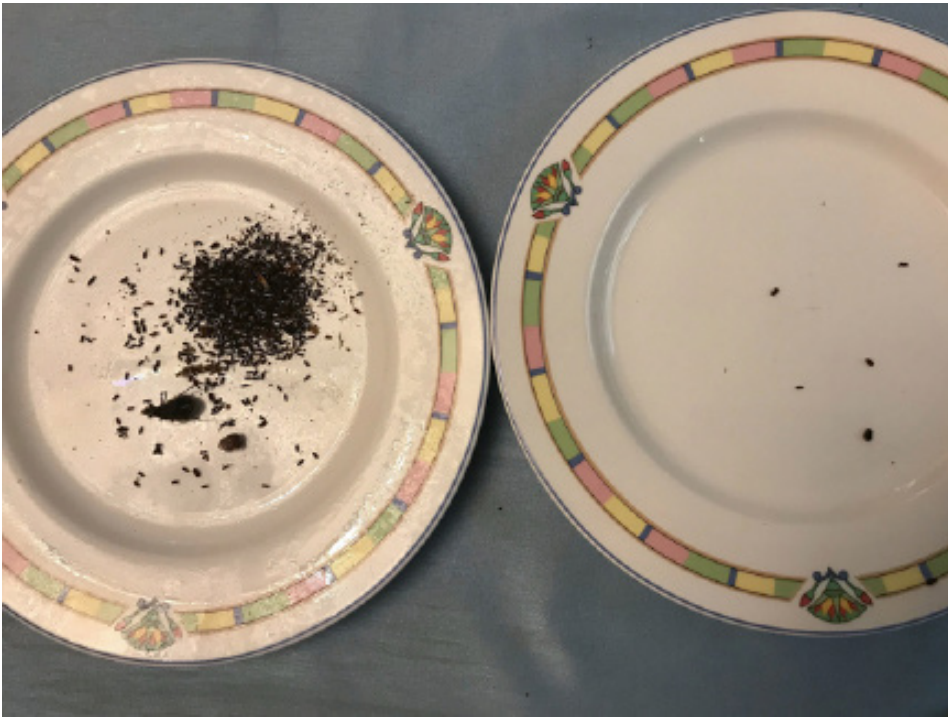
Ambrosia beetles in the trap from Brookeville on May 18 (left) vs trap count from Wye Research and Education Center on May 3