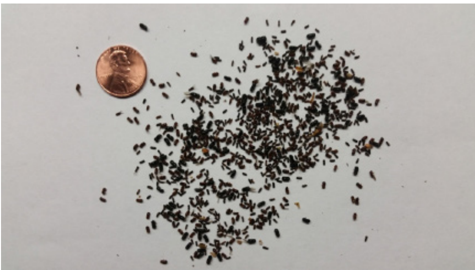
This morning's ambrosia beetle trap count at the Wye Research and Education Center since May 3