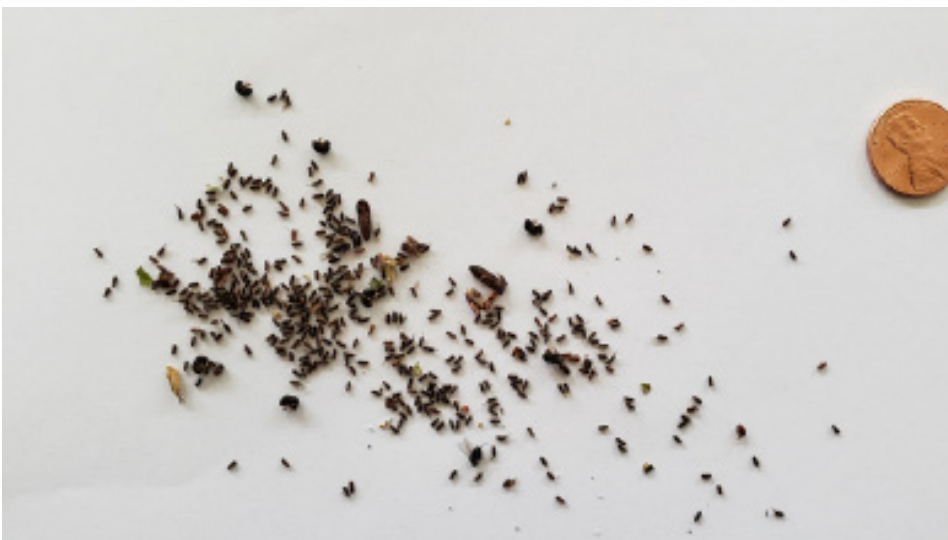
Ambrosia beetles in the trap in Darnestown since last Friday