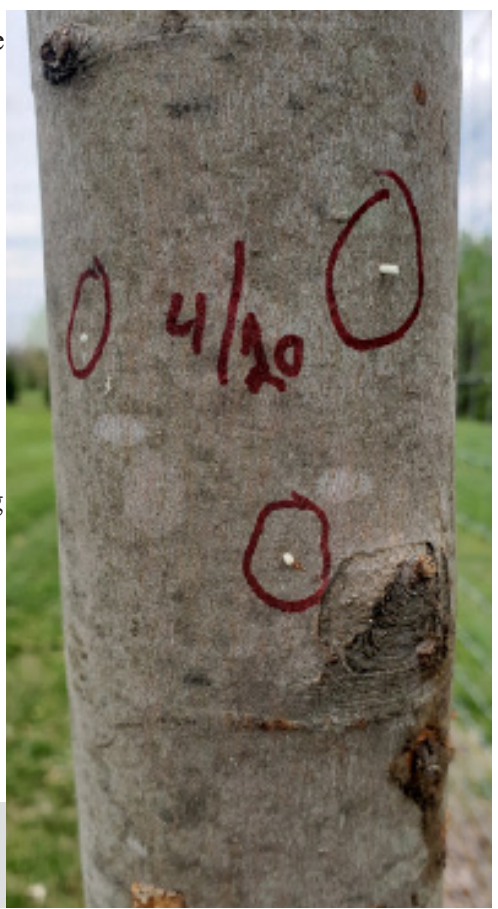
Frass tubes produced by ambrosia beetles are showing up on this alcohol baited wood bolt

It is best to assume we are getting a slight uptick in activity, so, if you have not already applied either bifenthrin or permethrin to the trunks of susceptible trees, DO SO NOW . We should get a couple of weeks of control with each application. I will update the situation in Friday's IPM report.