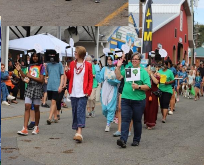
Damascus Community Club Participates at the Montgomery County Agricultural Fair.