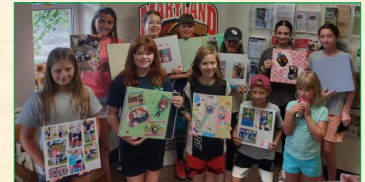
Scrapbooking with Shookstown Club on July 23rd