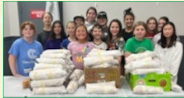
Sub making fundraiser