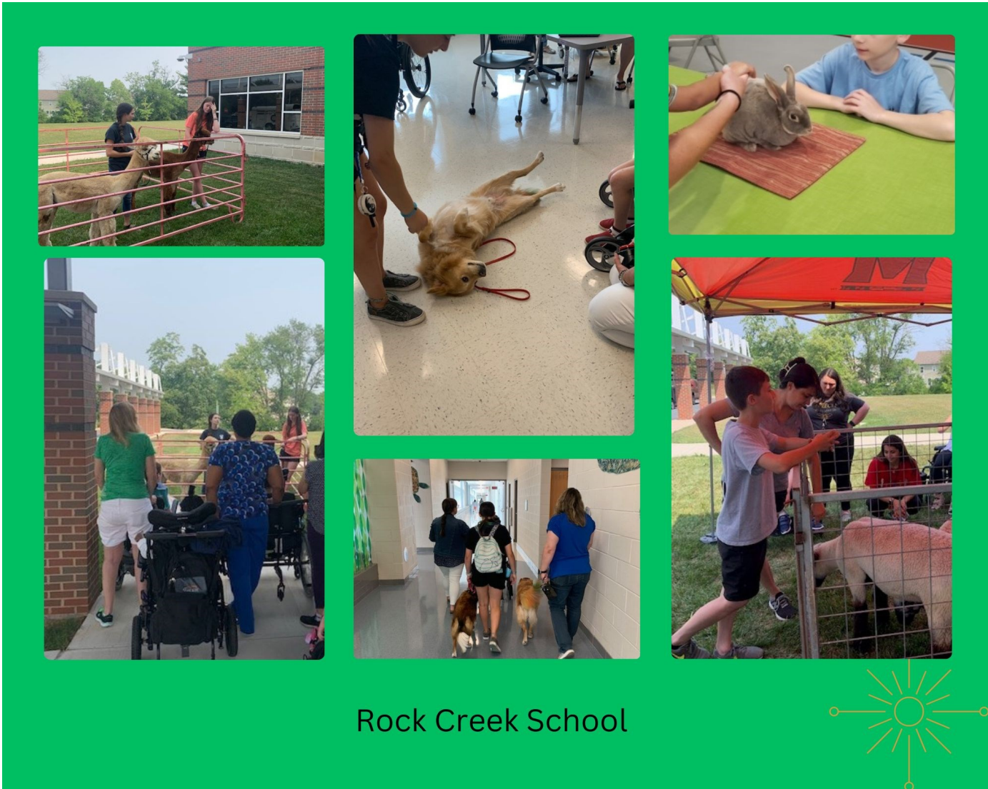
Rock Creek School

What a great partnership and experience all around!