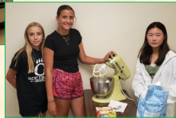
Cookie dough making day Aug 6th