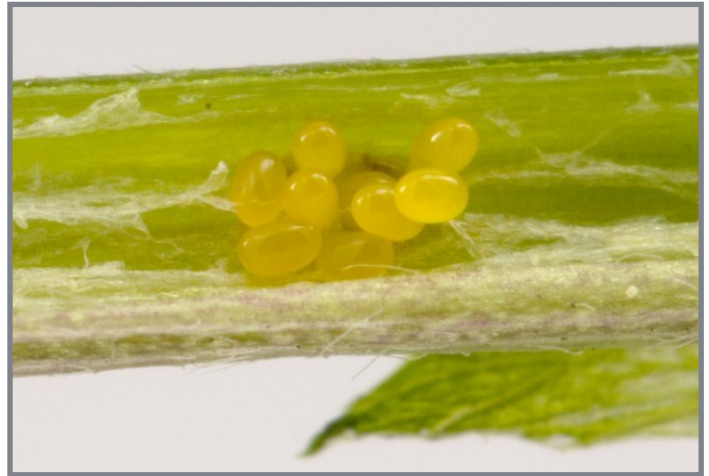
Figure 4. Oblong, orange alfalfa weevil eggs are found in alfalfa stems.