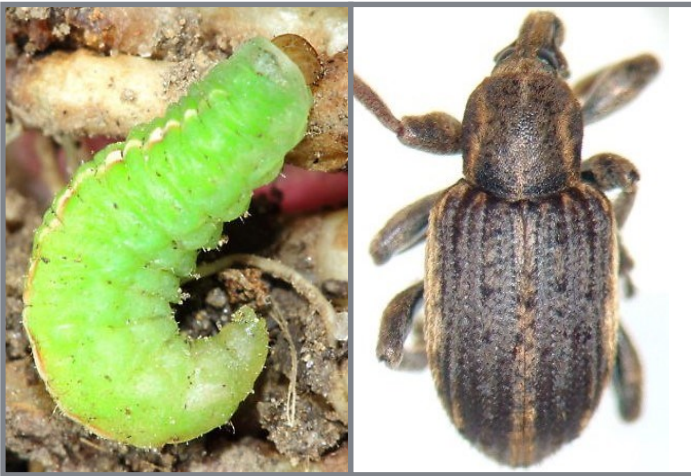
Figure 3. Late instar clover leaf weevil larva (left) and clover leaf weevil adult (right).