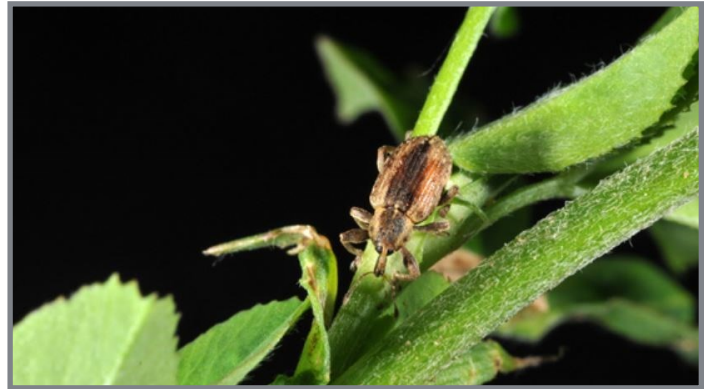
Figure 1. An adult alfalfa weevil on the leaf of an alfalfa plant.

The life cycle of alfalfa weevil in Maryland and states with similar climates usually consists of one full generation per year. Adults disperse in the fall and can lay eggs but generally a second larval generation does not occur in one year. 2 In the spring, adults emerge from overwintering sites and restart laying eggs. Adults oviposit 5-20 orange eggs in alfalfa stems (Figure 4). Due to fall and spring egg laying, two pulses of larvae may be seen in the spring, which can impact management decisions. 3