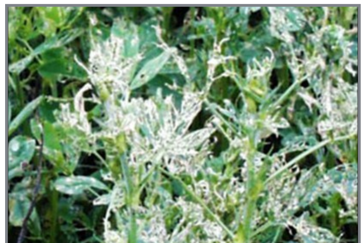
Figure 6. Typical leaf terminal skeletonization caused by larval and adult feeding.

The life cycle of alfalfa weevil in Maryland and states with similar climates usually consists of one full generation per year. Adults disperse in the fall and can lay eggs but generally a second larval generation does not occur in one year. 2 In the spring, adults emerge from overwintering sites and restart laying eggs. Adults oviposit 5-20 orange eggs in alfalfa stems (Figure 4). Due to fall and spring egg laying, two pulses of larvae may be seen in the spring, which can impact management decisions. 3