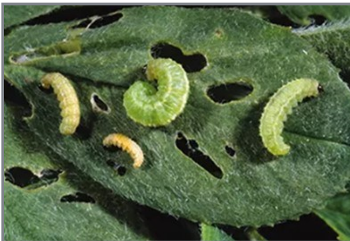
Figure 5. Alfalfa weevil larvae progress through four instars before pupation. Late instar larvae cause economic damage.