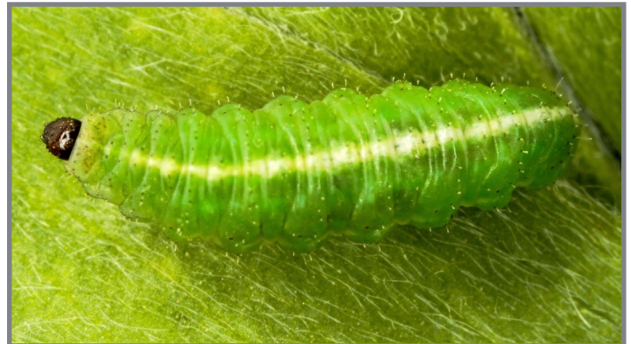
Figure 2. Late instar alfalfa weevil larva with characteristic black head and dorsal white stripe

First instar larvae emerge from the eggs after one to two weeks. In Maryland, alfalfa weevil larvae take about three weeks to progress through four instars (Figure 5) then they form silken cocoons and pupate at the base of the alfalfa plant or on alfalfa stems. Pupation can last one to two weeks before second-generation adults emerge in mid-June. 4