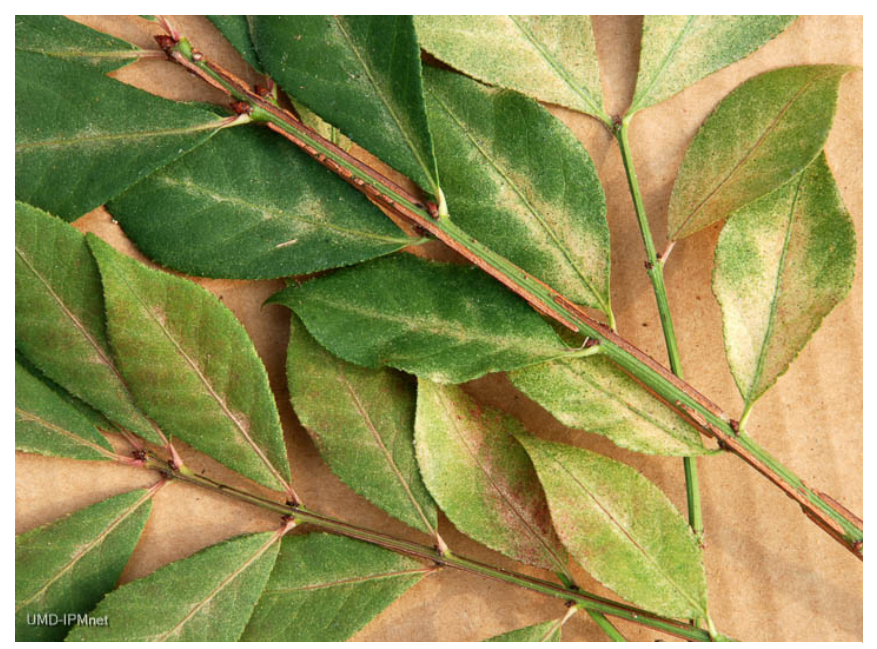
The hot, dry summer has provided ideal conditions for twospotted spider mites to flourish and cause heavy yellow, stippling damage on plants.

The aftermath of this extremely hot summer is going to be felt with many plants dying from extremely dry soils and hot weather conditions. It is very hard to keep plant material adequately watered and treated during these extreme weather periods.