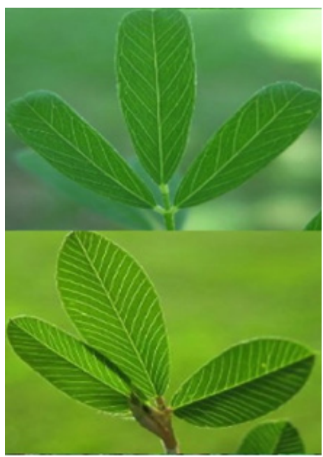
Photo 3: Leaves of sericea lespedeza (top) and annual lespedeza (bottom).