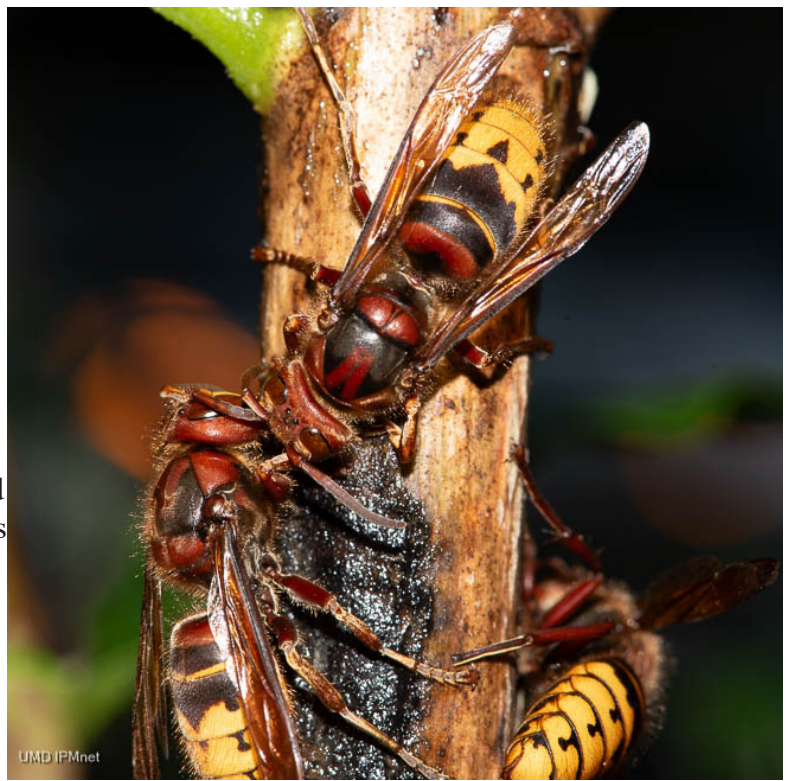
European hornets feed on the sap of woody stems as well as fruit.

With figs, they generally feed on them if you leave the fig on the plant too long into the ripening process. You have to check figs on a daily basis and pull the ripe figs as fast as you can before the wasps get to them. Once a fig is ripe for picking, every insect that loves sugar is going to show up to help themselves to harvest the fruit. That is not what most people want.