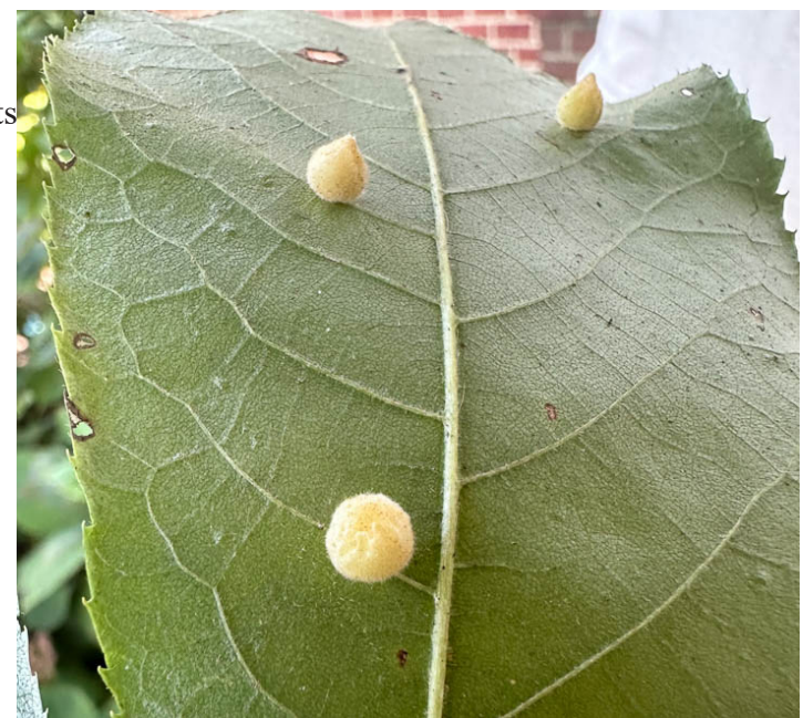
These hickory peach-haired galls are caused by midges.

Dave Freeman, Oaktree Property Care, found hickory peach-haired galls that are caused by midges. The gall midges drop to the soil to pupate. In the spring, the adults emerge from the soil and lay eggs on the developing hickory buds. These galls do not impact the overhall health of the tree, so control is not necessary.