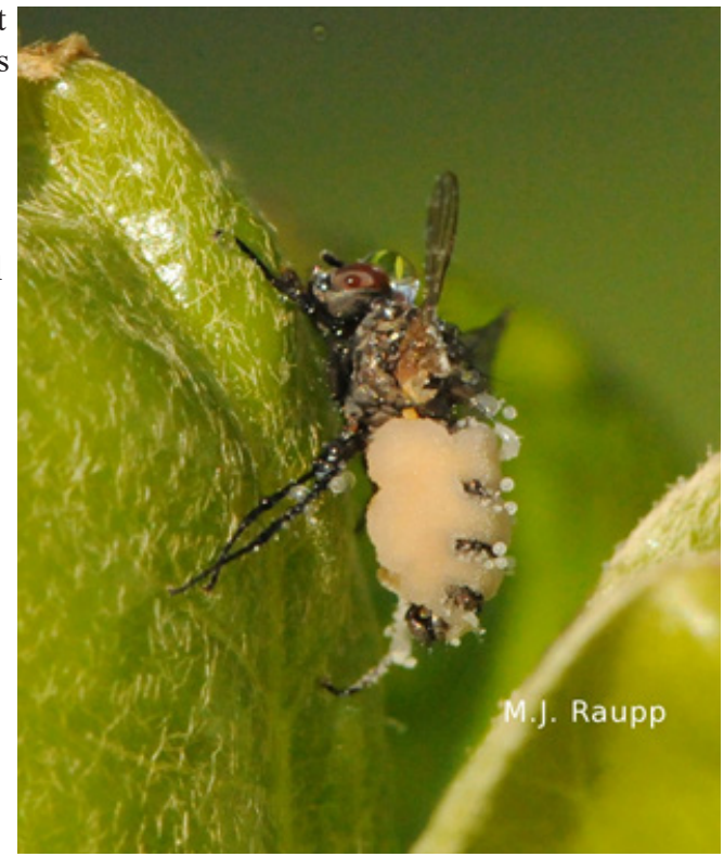
A dead seed corn maggot showing signs of infection by the fungal pathogen, Entomophthora muscae .

eggs in organic-rich soils. The eggs hatch and the translucent white larvae, called maggots, search for food. These maggots usually consume decaying organic matter, but when a cool wet spring delays germination and development of crops, seed corn maggots feed on seeds and the roots of seedlings still in the soil thereby creating significant injury. Seed corn maggot has multiple (4-5) generations per year. While a cool wet spring is favorable for larvae, as temperatures warm risk of infection increases for adult seed corn maggot flies. Although not visible to us, there are infective spores of a fungus called Entomophthora muscae on the vegetation of many plants. As the fly lands on vegetation, the tiny fungal spores attach to the surface of its exoskeleton (skin). When just the right temperature and humidity come together, the fungal spores germinate and the fungal hyphae penetrate through the exoskeleton of the fly and establish what will ultimately be a lethal infection. Once inside its host, the fungus penetrates the nervous system of the insect turning it into a fly zombie. Entomopthora manipulates the fly's behavior in several ways – all which benefit the survival and spread of the fungus. Research conducted on a related species of fly, the house fly, found that infected female flies became highly attractive to males. In the process of male flies "hooking up" with these infected females, spores on the