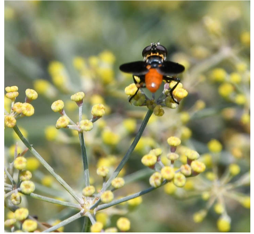
Adult feather-legged flies feed on nectar.

Dave Freeman, Oaktree Property Care, found this feather-legged fly, Trichopoda pennipes , this week. This tachinid fly is another generalist predator. Its main prey are squash bugs and southern green stink bugs. Female adults lay small white to gray eggs on the stink bug or squash bug. This fly overwinters in the larval stage in its overwintering host.