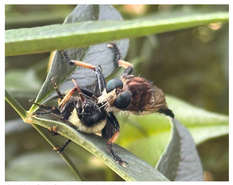
A robber fly is feeding on a bumble bee.