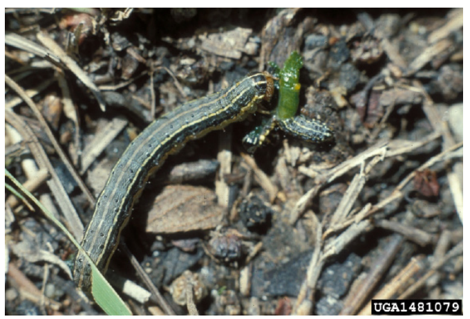
Fall armyworm caterpillar.

Back in 2020 and 2021, we had a major outbreak of fall armyworms in lawns. Fall armyworm is a native pest to North America. The weather has been perfect for it to flourish in August. The fall armyworm (FAW, Spodoptera frugiperda ) is a destructive pest that can feed on 80 different crop species, including corn and more importantly to the horticulture industry, turf. It clearly prefers