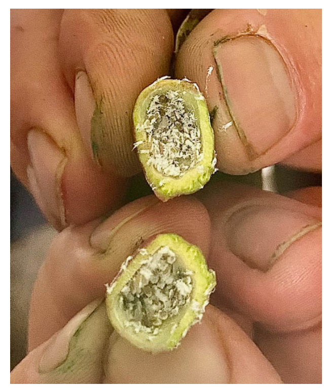
A cottonwood petiole gall broken in half to show what is within the gall at this time of year. The winged aphids leave these galls in June and July.