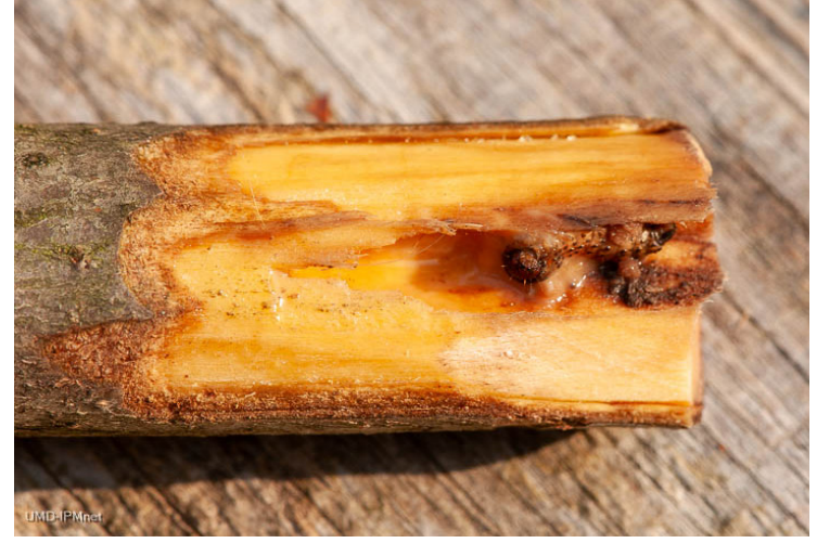
Wood leopard moth (Zeuzera pyrina) caterpillar within the stem of a dogwood.