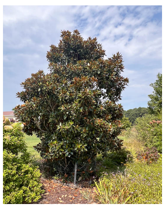
near the ocean and tidal rivers Magnolia grandiflora 'Little Gem' in the landscape.