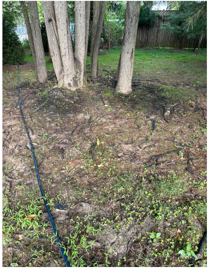
A lot of sooty mold is growing on the honeydew from SLF that has dripped onto the ground.