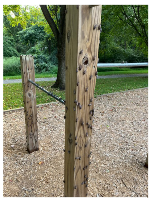
Spotted lanternfly adults covering posts along a Columbia path.

We are looking at the safest materials that your homeowners could potentially use on adult spotted lanternflies to deal with large clusters on lower trunks. Understand soap and oil is merely a contact material and has no residual impact on SLF, but it may provide something your customers could apply safely in home landscapes to knock down large accumulations of adults.