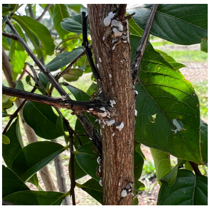
The current crapemyrtle bark scale population on one of the plants here at the research center.