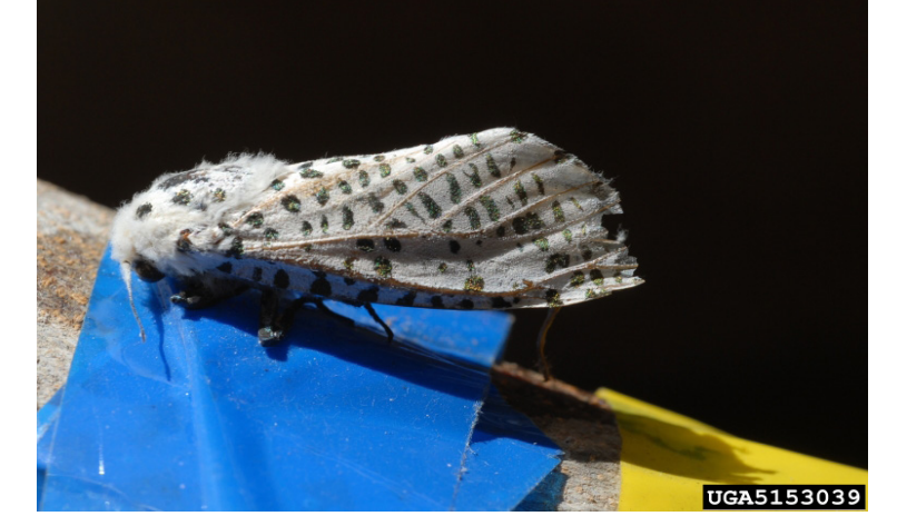
Giant leopard moth ( Hypercompe scribonia ) caterpillar and moth.