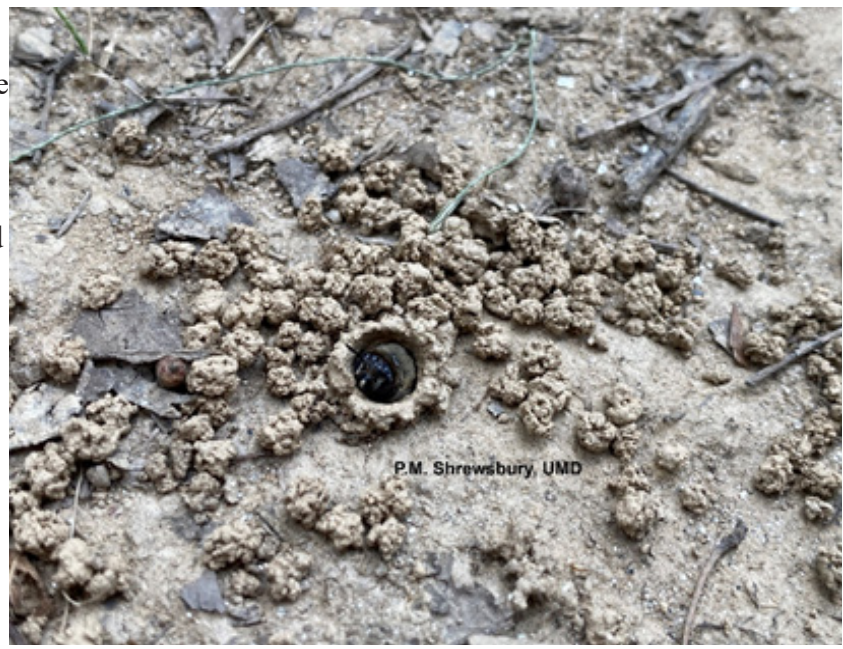
Ptilothrix bombiformis bee with its head sticking out of its nest opening. Note the mud turret and pellets which were created when removing soil from its nest gallery.

Ptilothrix bombiformis adults are active from mid-summer through early fall which coincides with the bloom period of Hibiscus species. Each female Ptilothrix builds vertical nests in soil that is hard-packed and near water. The Ptilothrix female flies to water, appearing to walk on the water, imbibes some water and returns to her home site where she regurgitates the water. The water moistens and softens the