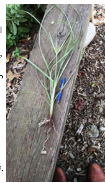
Photo 2: Yellow nutsedge overall plant.

In turf applications products that contain sulfentrazone like Dismiss® have been shown to provide both pre-emergence and post-emergence control, though it is not labeled for pre-emergence. Prodiamine, in products like Barricade® + sulfentrazone is labeled for pre emergence control. Sulfentrazone plus quinclorac (Solitare®) is effective as a post emergent product, but will require more than one application, in some cases 30 days apart. Other products containing sulfentrazone include Q4 Plus®, Surge®, SureZone®, and TZONE®, but these products are labeled for suppression as they contain lower concentrations of the active ingredient. Other products labeled are bentazon found in Basagran®, which is labeled for use in tall fescue, the predominant species in this region; halosulfuron-methyl found in Sedgehammer® and Sedgehammer+® (Sedgehammer+ contains a surfactant), S-metolachlor found in