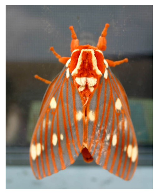
The regal moth is a bright orange color and is easy to spot.

The hickory horned devil is the caterpillar of the regal moth ( Citheronia regalis ), and one of the biggest caterpillars in Maryland. It favors walnut and hickory as hosts, but can also be found on sweetgum, persimmon, pecan, and sumac. It is common in the deep south, but its range has shrunk since the mid-20th century. The caterpillar's later stages grow curved spines, earning it the "horned devil" part of its name, but these spines are entirely for show as they are harmless. It causes minimal damage when it feeds, so no control is necessary.