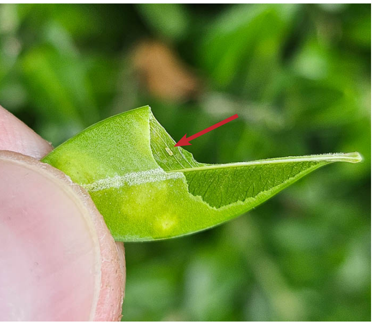
If you see chlorotic areas on the top of boxwood leaves, split open the leaf and look for leafminer larvae. Luke found small larvae within these leaves.