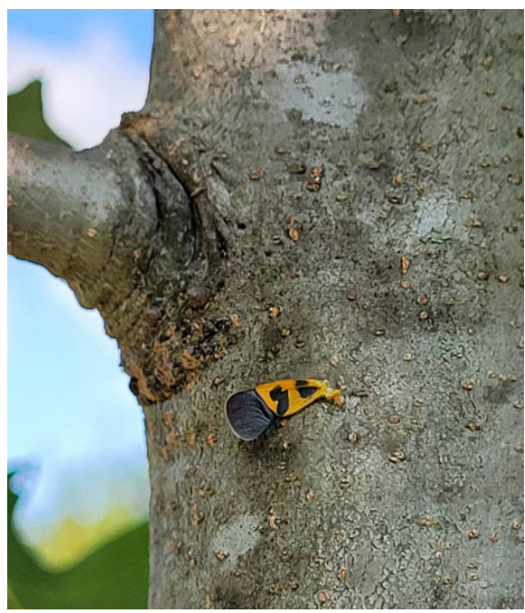
This wing is what is left of what the praying mantid had as a meal.