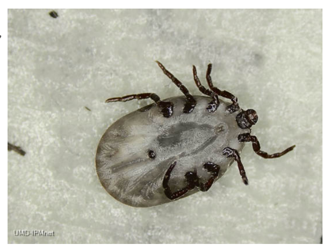
Underside of blacklegged tick.

In the areas that have received rain over the last week, we are seeing a lot of activity of black legged ticks, Ixodes scapularis , and the lone star tick, Amblyomma americanum . In the areas receiving rain, the weeds are growing like crazy this week. Tall weeds and grasses are perfect ares for tick populations. Have your workers apply Deet repellent and check themselves at the end of each day for ticks. Whole body examinations are probably a good idea at the end of each workday.