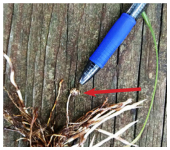
Photo 1: Yellow nutsedge primarily reproduces by tubers.

As a result of this misconception, yellow nutsedge can be difficult to control with approaches that are better suited for grasses. In this, some agricultural circles see yellow nutsedge as a serious challenge to weed control in crop production. The sedge family is quite large with some 5,500 known species distributed across the globe. Though we are most often faced with yellow nutsedge in the Mid-Atlantic, with purple nutsedge being commonly found in the Southeastern United States.