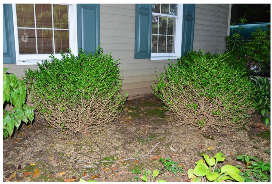
Have boxwood checked for boxwood blight if you have heavy defoliation of plants.

Fall can be an active time for boxwood blight infection in Maryland landscapes. Especially as night time temperatures decrease causing dew formation. The most characteristic symptoms of boxwood blight are brown leaf spots that lead to rapid defoliation, and black streaking on stems. This combination of plant symptoms leads to plant dieback. The disease is caused by the fungus Calonectria pseudonaviculata. This fungus also produces resting propagules, (microsclerotia), that enable it to survive long periods in the soil surrounding infected boxwoods. Other susceptible hosts within the boxwood family include pachysandra, both Japanese spurge, P. terminalis and Allegheny spurge, P. procumbens, and sweet box, Sarcococca.