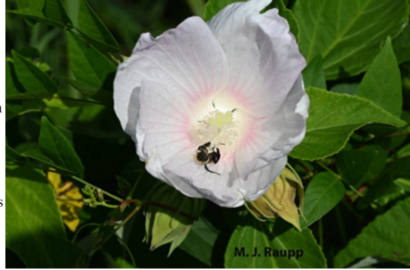
A Ptilothrix bombiformis bee foraging in a marsh mallow flower for resources to bring to its nest for its young.

soil so the bee can excavate its burrow, which usually has one to two cells (each cell will support a bee larva) in it. In building her soil gallery, Ptilothrix creates small balls of soil, using the water she imbibed, which she rolls out of the gallery using her hind legs. Characteristic to this species are mud turrets at the top of the entry hole and numerous small "mud pellets" of soil around the hole. A female Ptilothrix can make several nests in a season. Although Ptilothrix is a solitary bee, it is common to find aggregations of Ptilothrix in the same area.