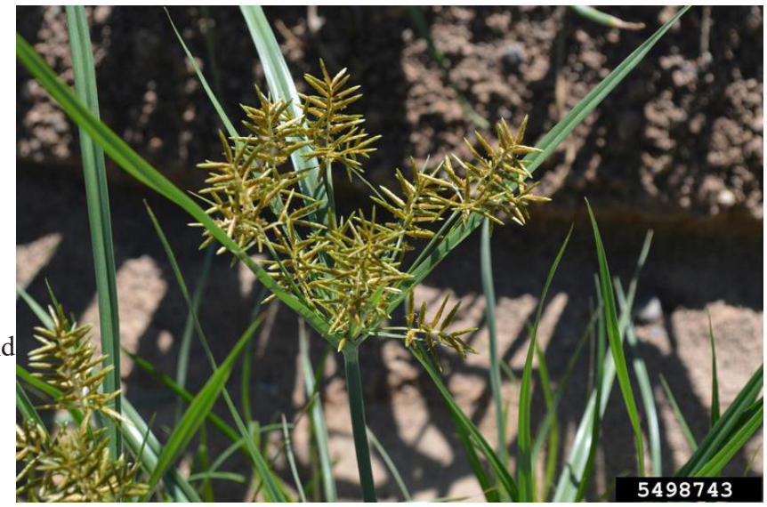
Yellow nutsedge seed head. Howard F. Schwartz, Colorado State University, Bugwood.org

In landscape and nursery settings, it was found that Pennant Magnum® (s-metolachlor), Sedgehammer®, and Casoron® (dichlobenil) worked well. Check labels to determine plant species that are safe for use with each chemical. Casoron® as a granular product (4G) can be applied as a pre-emergence product during the dormant season in nurseries