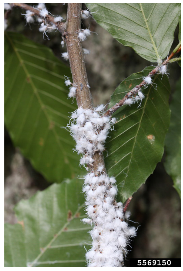
Beech blight aphids are also called 'boogie woogie' aphids becuase they move in unison when threatened.

The beech blight aphid is a medium-sized, bluish-gray aphid covered in long waxy filaments. It cycles hosts between the American beech tree and the bald cypress, excreting copious amounts of honeydew. Sooty mold grows on the honeydew and is most obvious as colonies reach their peak in September and October. If brushed with bare skin, the aphids will use their mouthparts to "sting" the attacker, but they have no venom and cannot inflict anything beyond mild discomfort. Heavy infestation can cause branch dieback, but tree mortality is uncommon, unless the tree is undergoing other stressors as well. The main reason for control is the unsightly appearance of infestations and the resulting sooty mold. For minor colonies, the insects can be physically removed with a jet of water. Natural control consists of parasitoid wasps and beneficial predators, which are most effective in the long term. For more severe infestation, any insecticide labelled for aphids will work, including horticultural oil sprays and insecticidal soaps.