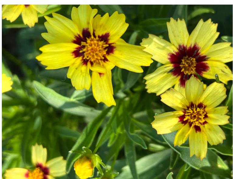
Coreopsis grandiflora 'Sunfire' is compact cultivar of native tickseed.