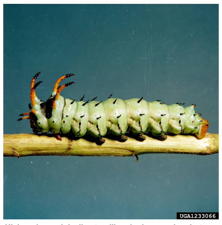
Hickory horned devil caterpillars look menacing, but they are not.