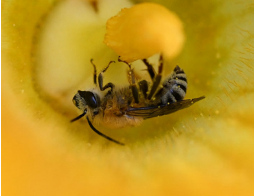
An eastern cucurbit bee, Peponapsis pruinose , foraging inside a pumpkin flower for nectar and pollen.

One of the most entertaining was the eastern cucurbit bee, Peponapis pruinose (Hymenoptera: Apidae). The genus name Peponapis literally means "pumpkin bee". Sometimes as many as four <u>eastern cucurbit</u> bees with their striped abdomens tussled for access to nectaries deep inside the blossom. These wonderful bees are specialists, collecting pollen only from members of the cucurbit family. Females construct burrows in soil a foot or more in depth and prepare several brood chambers along the gallery. Each chamber is provisioned with pollen and nectar to feed