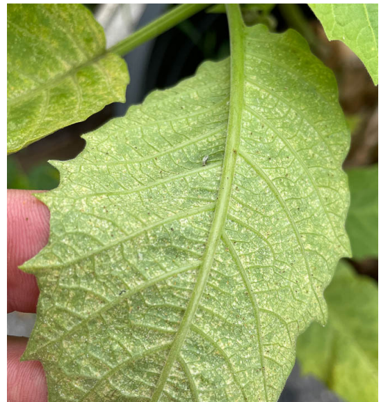
Look on the underside of leaves with stippling damage for stages of spider mites.

Here is the problem, it is difficult to find a day when it is cool enough to apply a miticide without causing phytotoxicity. It can be done, but this means you will be applying a miticide early in the morning when temperatures are below 90 °F. Try to use wettable power formulations for the least chance of phytotoxicity.