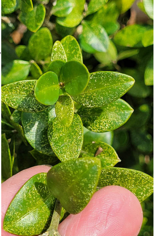
A lot of stippling from boxwood spider mite feeding.

Another insect problem on boxwood that Marie found are tiny boxwood leafminer larvae on several boxwood varieties. When boxwood leafminers are out of their summer diapause stage, you can use systemic or translaminar insecticides for control. Cut a leaf open to check if the larvae is actually moving around to show that it is out of summer diapause.