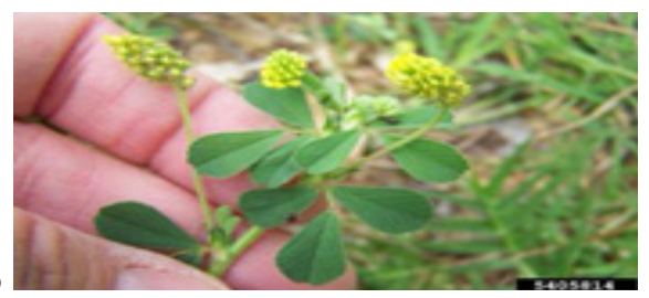
2. Black medic plant

1. Black Medic Seed - Interestingly this weed produces yellow flowers that coil into black pods, which is how it gets its name.