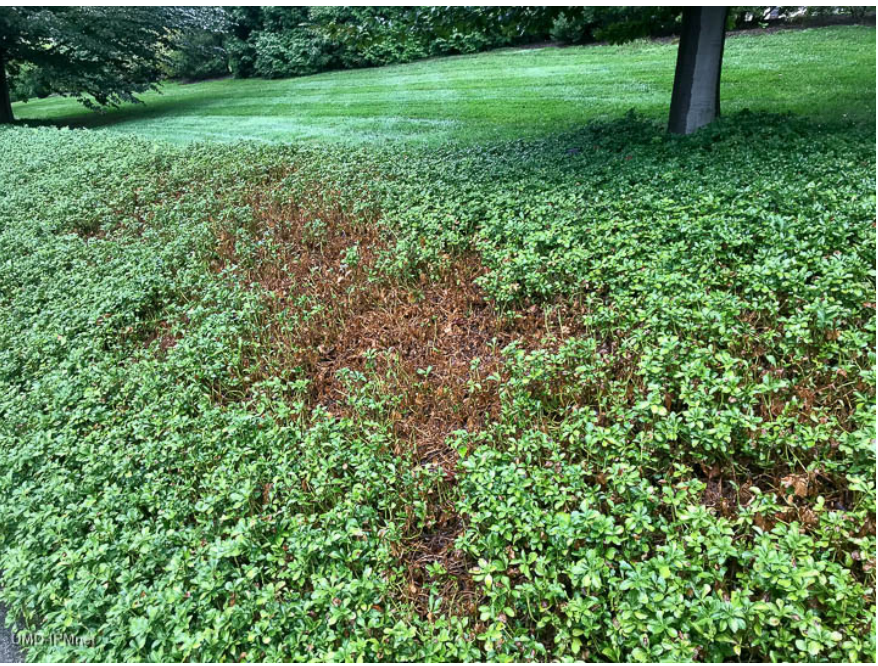
Volutella infection in pachysandra.

Paul Wolfe, Integrated Plant Care, reported Volutella infection on pachysandra this week in Bethesda. Light rain and high temperatures provide optimal conditions for this disease. There is not much to do at this point. Use a mower to remove infected leaves. The mower should have a bag to collect the foliage and stems to remove the inoculum from the area. Plants generally recoup later.