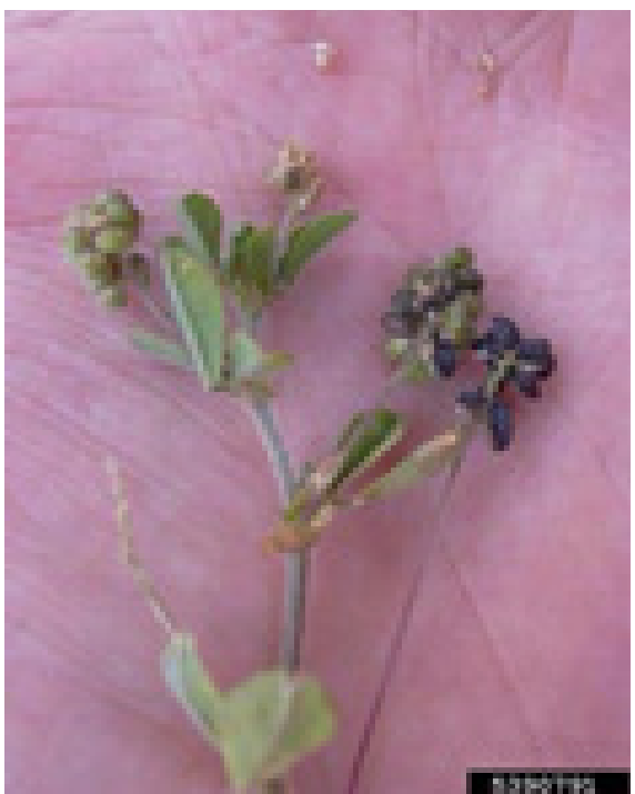
3. Black medic fruit