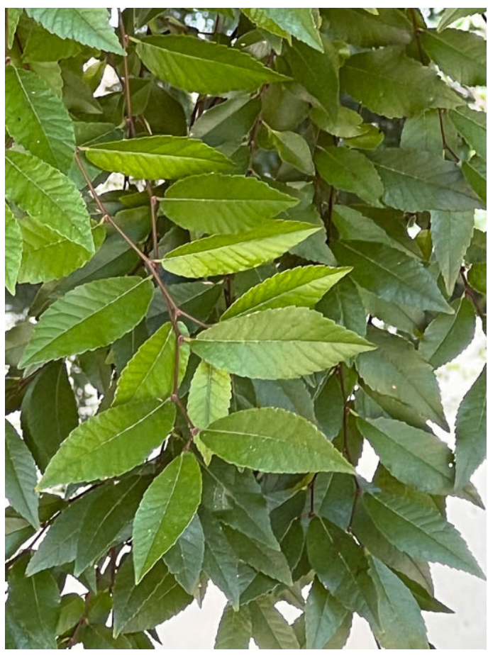
Use lace bark elm in the landscape for its ornamental exfoliating bark, and green summer leaves that turn yellow or purple to red.