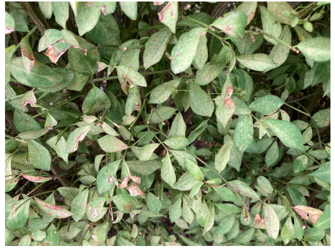
Spider mite damage on burning bush euonymus.