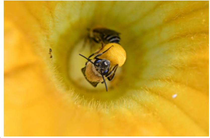
A male eastern cucurbit bee looks up at the camera while another gathers food in a pumpkin blossom.

the developing young. Larvae develop through summer and autumn and emerge next spring when squash, pumpkins, and other cucurbits start to bloom. While females labor to build their subterranean nurseries, when blossoms close in the mid-morning heat, males can sometimes be found resting inside closed blossoms. These native bees evolved to pollinate their cucurbit hosts and can be found from Canada to Mexico.