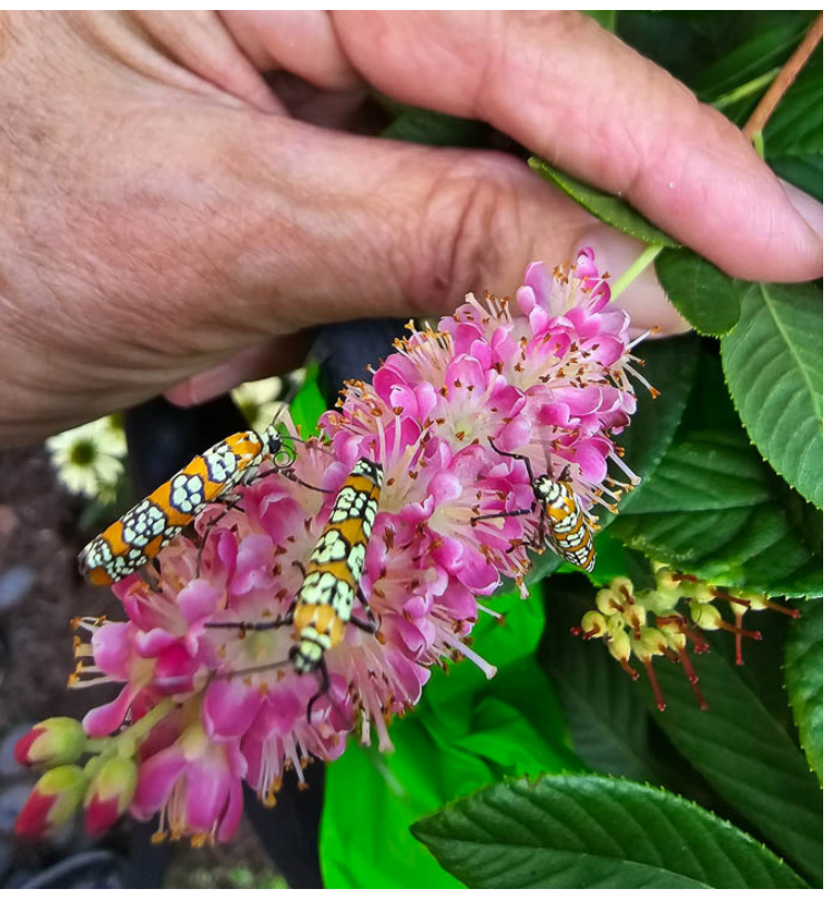
Adults of Ailanthus webworm are moths that you will see on flowers in the daytime.

Ailanthus webworm moths become more common on flowers as we move through later summer. Barbara Mugaas, Virginia Master Gardener, found them at Clethra flowers this week. Adults are pollinators. In this area, the caterpillars feed on Ailanthus .