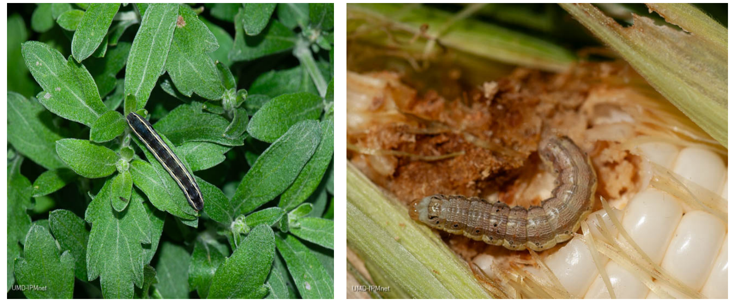
Yellowstriped armyworm (left) and corn earworm (right) are several caterpillars that feed on mums.

We're heading toward the beginning of August, so expect to see a variety of caterpillars feeding on tree foliage. The trees will not die, but expect defoliation on them. Beware of caterpillars on chrysanthemums as they are highly attracted to caterpillars. Some caterpillars to watch out for are corn earworm ( Helicoverpa zea ), corn borer ( Ostrinia nubilalis ), saltmarsh caterpillar ( Estigmene acrea ), yellow striped armyworm ( Spodoptera ornithogalli ) and a variety of other moth caterpillars that will be attracted to chrysanthemums. Control: Spinosad applications work well on caterpillars. Mainspring and Acelpyrn continue to be strong materials for control options.