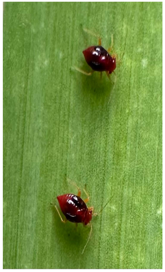
Feeding by yucca plant bugs causes yellow spots on foliage that will eventually coalesce and turn brown.