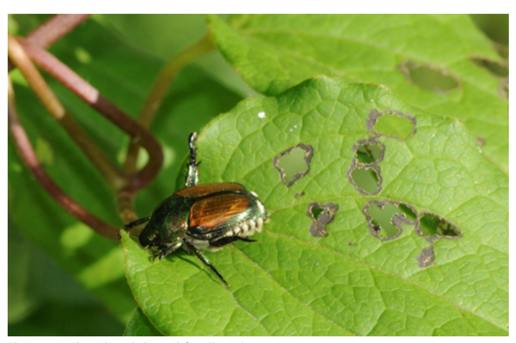
Japanese beetle adult and feeding damage.

Japanese beetle and Oriental beetle adults are relatively similar in their life cycles and management. We have had reports of moderate Japanese beetle activity so far this season. Japanese beetle adults skeletonize foliage and can cause significant damage to many species of ornamental plants (over 300), most commonly linden trees and roses. Oriental beetles are usually less conspicuous and damaging than Japanese beetles. I have seen low numbers of Oriental beetles for at least 3 weeks already. I often find them feeding on the flower petals of many herbaceous plants. They seem to particularly like Shasta daisies and cone