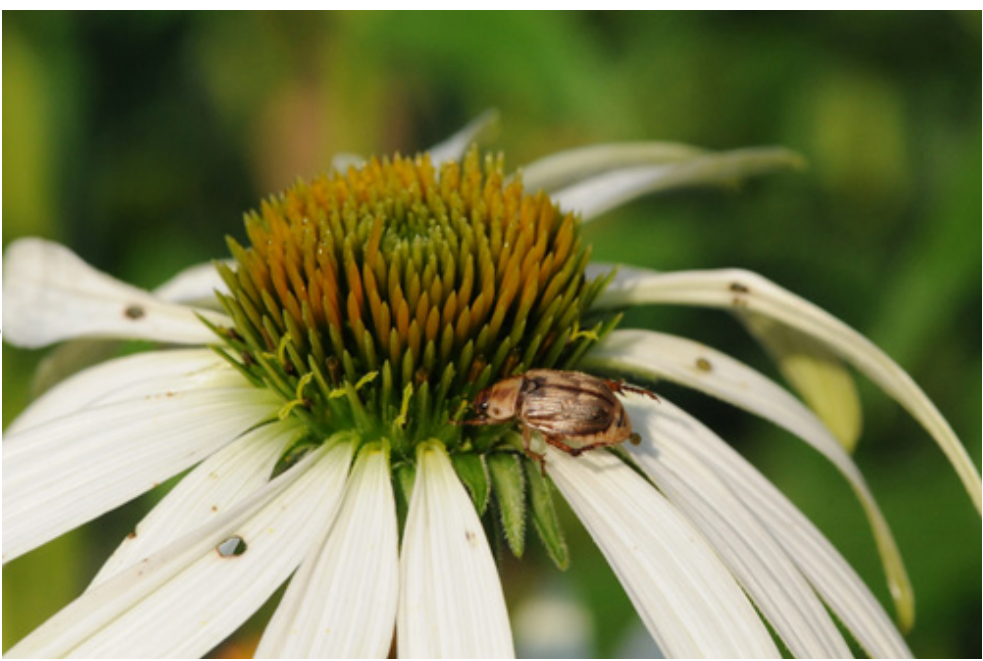
Oriental beetle feeding (and pooping) on coneflower flowers.

flowers. Oriental beetles usually do not warrant control. Japanese beetles often require control measures. Control: Research has shown that once Japanese beetles start feeding on plants the plant releases a chemical cue that calls in other Japanese beetles to the plant. A good practice is to stop Japanese beetles as soon as you see them, before they do much feeding damage and attract their friends. If there is relatively small amounts of skeletonization damage on leaves, I suggest you remove those leaves. If you do not have "lots" of plants