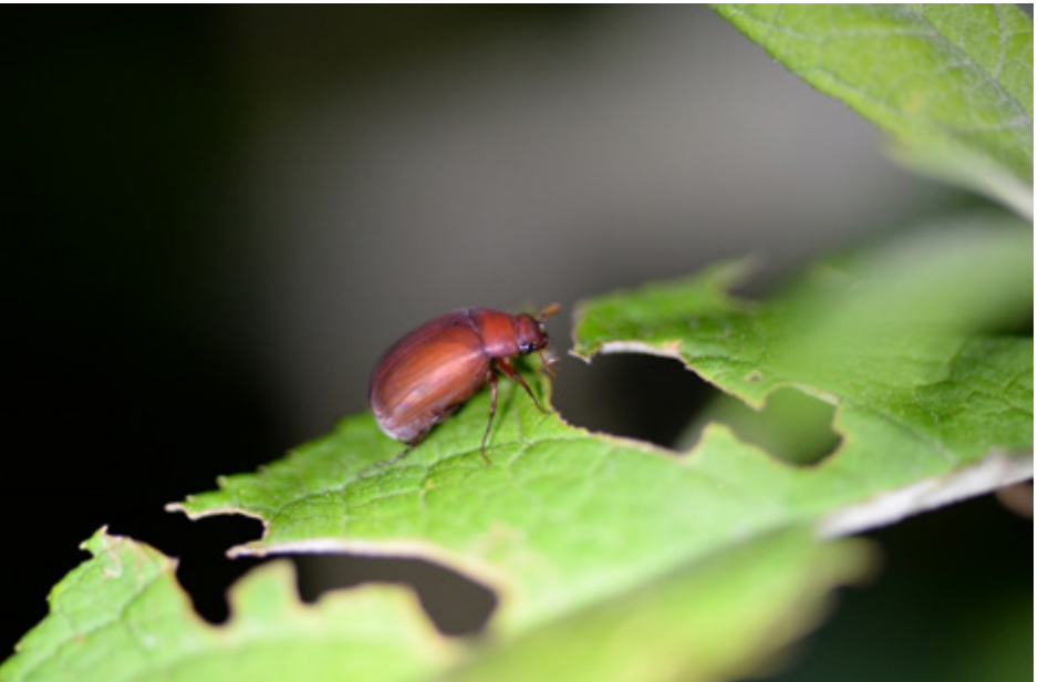
Asiatic garden beetle feeding on butterfly bush at night.

Asiatic garden beetle adults are tricky little guys. About a month ago I started to see significant feeding damage on the foliage of my Buddleia (butterfly bush) and sunflowers, but saw no insects on the plant. From past experience, research and monitoring, I knew it was Asiatic Garden beetles causing the damage. Asiatic