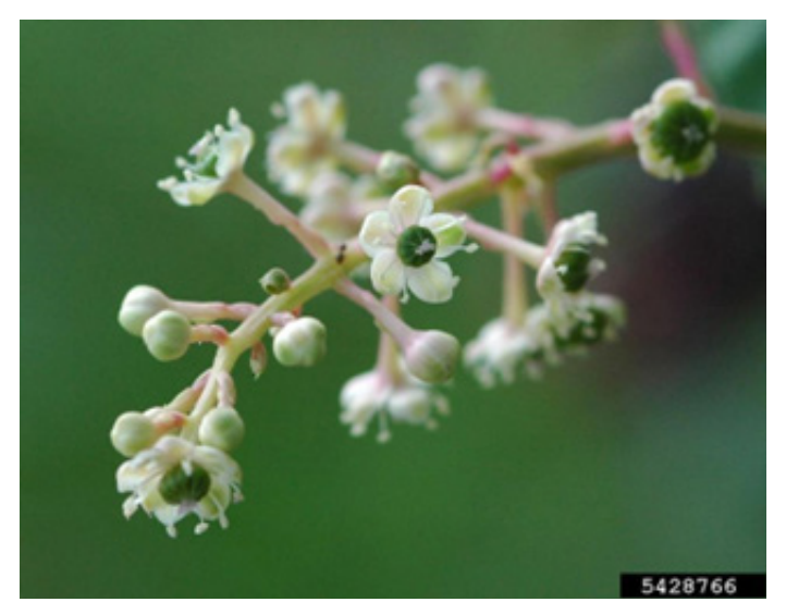
Figure 3. Pokeweed flowers with small, green, immature berries beginning to form.