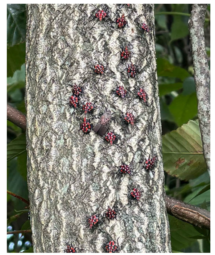
Many fourth instar spotted lanternflies are covering this Ailanthus tree trunk.