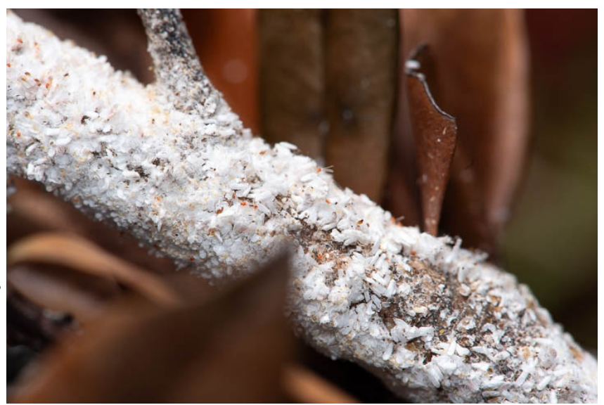
Many male white prunicola scale are covering this cherry laurel branch.

We are currently in the second generation of white prunicola scale, so you may start to see some build-up of "flocking" on cherry laurel, Prunus spp., hollies.. etc. The "flocking" is the build-up of male WPS covers. At this time, contact pesticides will be unsuccessful because settled instars have already begun to create their protective cover. The next peak crawler emergence is typically at around 3238 degree days, and we are in the 2000s. Smaller trees may benefit from systemic or IGR at this point, but the best course of action would be to scout for crawlers and treat them.