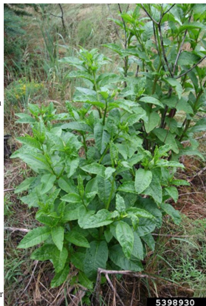
Figure 2. Mature pokeweed foliage.

Mowing can be used to control pokeweed; as a perennial, it does not like frequent mowing. Preventing seed production is important to prevent the growth of additional plants; however, it is also important to control the root as well. Herbicide options in open areas include 2,4-D, dicamba, and Garlon 4; these are all selective products that can be used to control pokeweed. Caution with these products needs to be considered as they can potentially drift or volatilize and damage desired plant species. Prizefighter and Avenger can be used to control pokeweed when the plant is immature. Glyphosate can be used also but is non-selective and can damage any plant material it comes in contact with; however, volatilization is not an issue as with other products. Be aware that exposed roots and suckers of desired plants can uptake these products and cause damage.