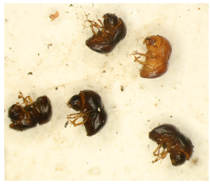
Camphor beetles infested sweet bay.

Jeff Davis is reporting camphor beetles causing heavy damage on sugar maples in New Jersey. The extreme heat is stressing trees and making them more susceptible to beetle infestations. Consider making a bifenthrin application at this time.