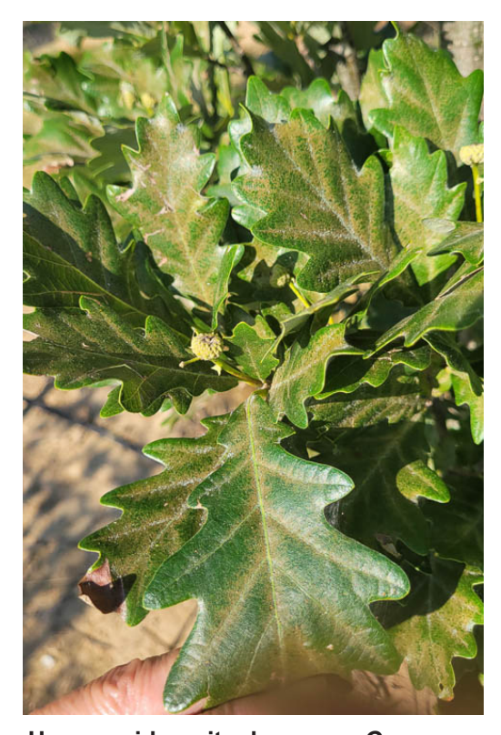
Heavy spider mite damge on Quercus x robur 'Long'.