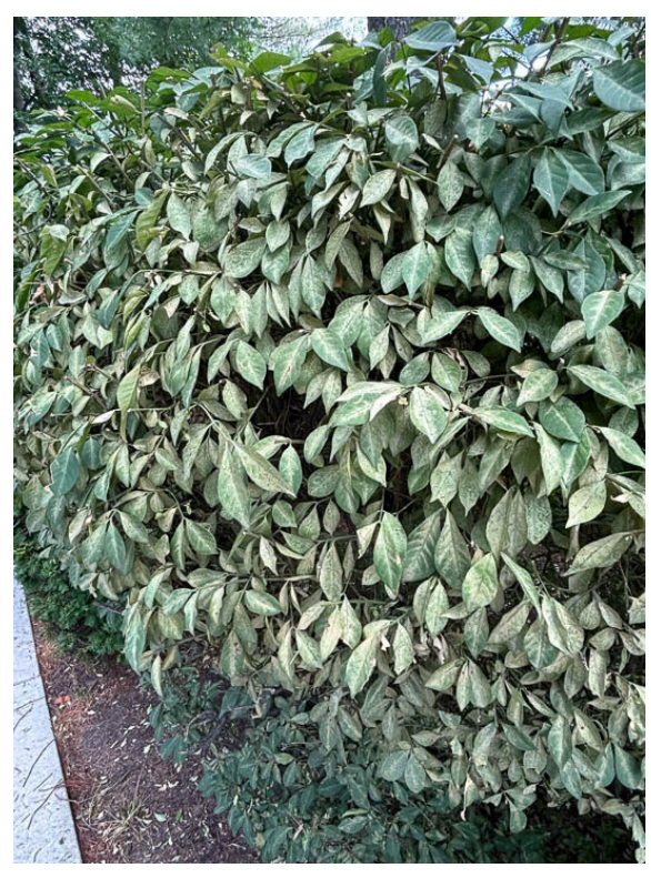
Burning bush euonymus is a plant we often receive reports of being infested with spider mites.

With the hot temperatures and so little rain this summer, spider mites are very active and causing a lot of damage. Marie Rojas, IPM Scout, is reporting that, "Spider mites are high on many species of oaks, Taxodium distichum , as well as Green Giant arborvitae." Todd Armstrong, The Davey Tree Expert Company, found a hedge of burning bush euonymous infested with spider mites in Lutherville on July 10. Spider mite feeding causes heavy yellow stippling damage to foliage. Damaged tissue can turn yellowish brown over time. Registered miticides such as Avid can be used for control if necessary. When using horticultural oil, be sure to get good coverage of the undersides of the foliage. Avoid using oil during periods of high temperatures above 90 °F, hot and humid periods, and on wilted or stressed plants (due to drought for example)..