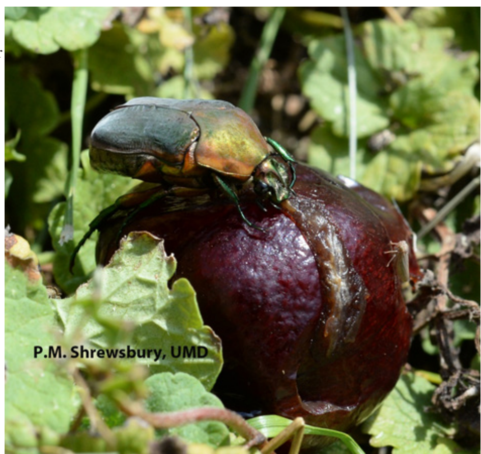
Be sure if you are considering applying Green June beetle adult feeding on cherry.

Green June beetle adults are just starting to be active this last week or so. I have seen them in Boonsboro, MD and Richmond, VA. Green June beetles are large metallic green and gold scarab beetles. They are often seen swarming around trees (often those with thin skinned fruits that the beetles feed on) or over turfgrass where they are likely looking for mates or a site to lay their eggs. As adults, these beetles seldom warrant control measures, except in golf course environments due to their behavior of burrowing in the soil.