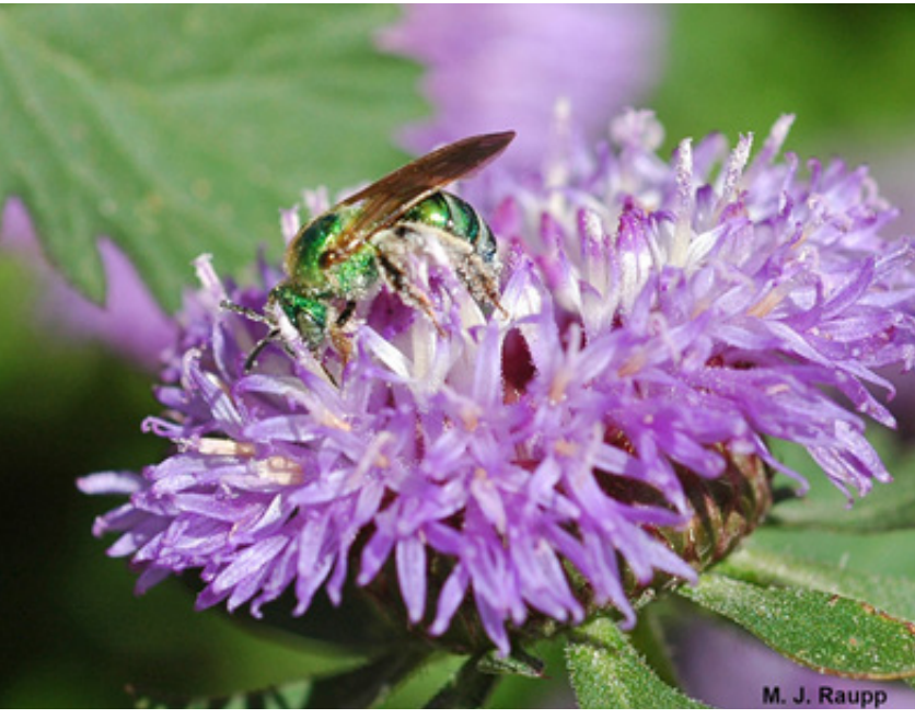
Halictid bees (a.k.a. sweat bees) are some of the most beautiful bees with their metallic coloration.

Halictid bees are interesting because different species range in their level of "sociality". A particular species can be solitary where every female care for her own young, like many mason bees that we have to discussed previously, while other species may be eusocial (truly social) with queens producing