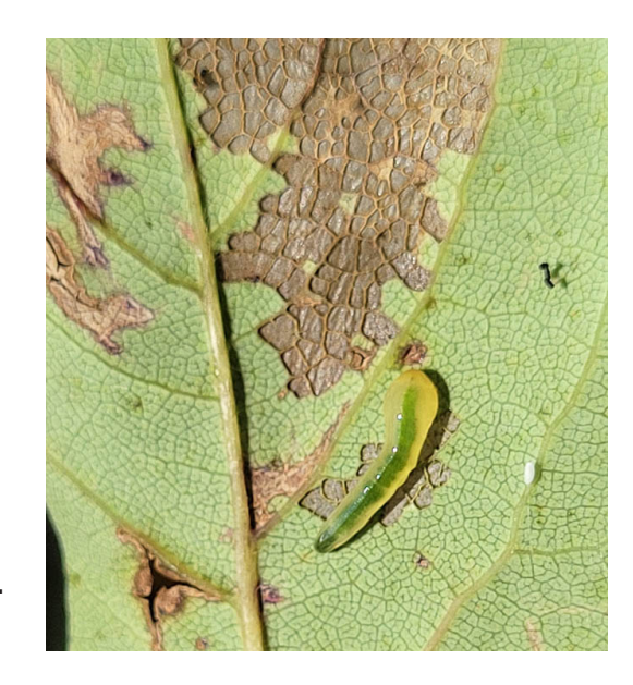
Blackgum leafslug sawfly larvae skeletonize leaves.