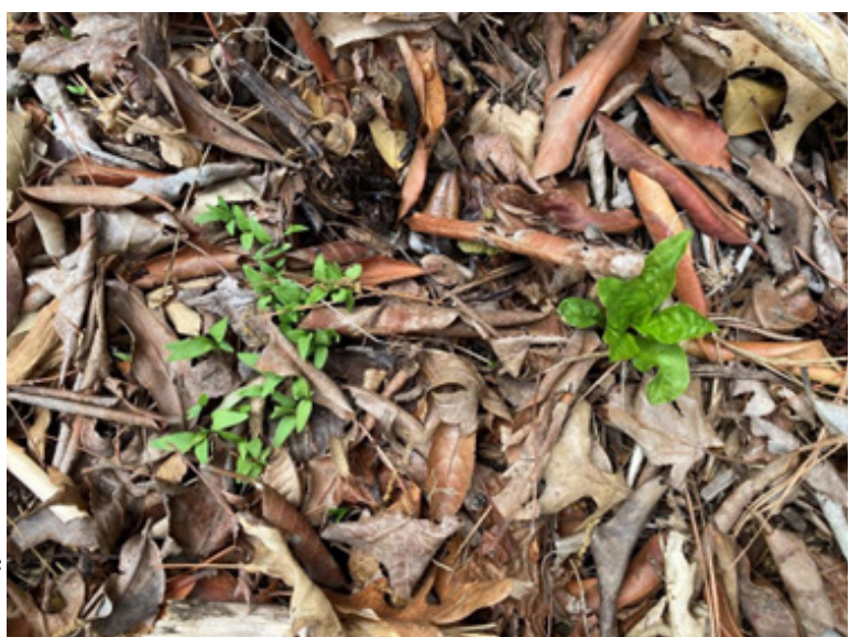
pokeweed plants are at the flowering stage (Figure 3). Noticeable dark, purple berries will soon begin to

As a perennial, pokeweed plants can germinate from existing roots as well as from seeds (Figure 1). Seedlings have long, somewhat narrow leaves that come to a point at the end. Mature leaves are large, alternately arranged on the stem, smooth, and often have a reddish color on the underside. Leaves can be longer than fifteen inches and are usually about one third as wide as they are long (Figure 2.) Right now, pokeweed plants are at the flowering stage (Figure 3). Noticeable dark, purple berries will soon begin to