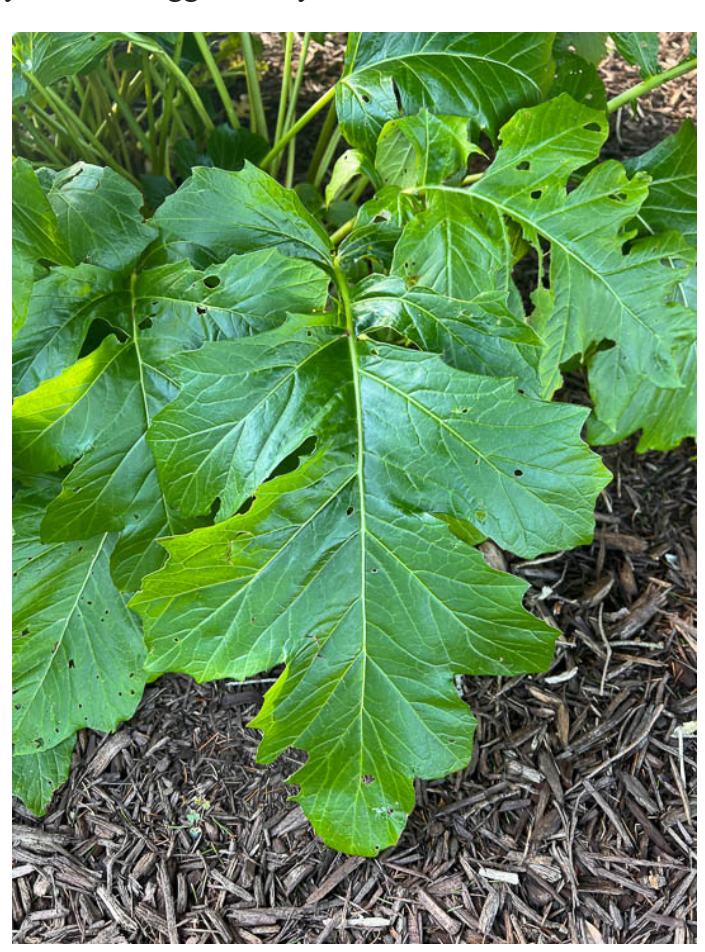
Flowers and foliage of Acanthus mollis 'Oak Leaf' in the landscape.