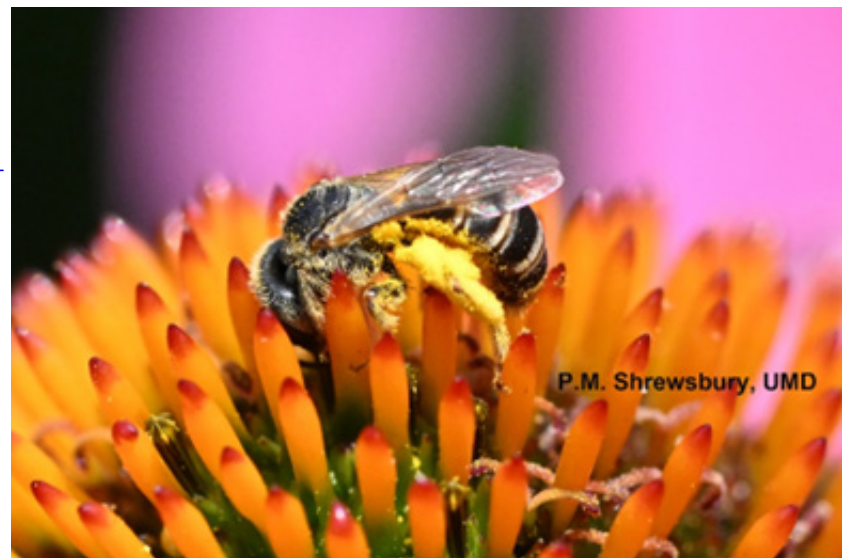
Plant flowers to attract beautiful sweat bees like Halictus spp.

non-reproductive daughters, known as worker bees, tasked with foraging for nectar and pollen and tending the brood of their mothers, like honey bees.