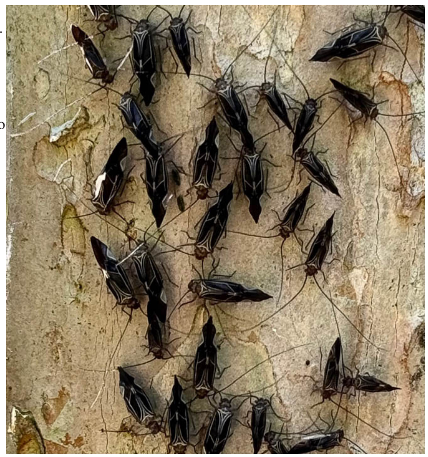
Barklice adults were found on the trunk of crape myrtle.

Nancy Woods found barklice ( Cerastipsocus venosus ) on her crape myrtle a few weeks ago. These Psocids show up in hot humid weather, usually after a rain incidence. They feed on lichens, decaying organic matter, dead insects, molds, fungi, and pollen. At times, they show up in large numbers on tree trunks. Barklice do not feed on living plant material, so control is not necessary.