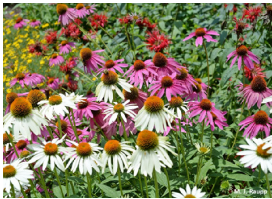
and a nest. They die after the nests are built and provisioned. There is more than one pollinators and natural enemies.

and natural areas, and they live in burrows they dig in the ground. Halictus ligatus / poeyi are considered to have a semi-social (=halfway social) or primitively eusocial lifestyle. This means they have some level of social organization and cooperation but not to the extent of honeybees. Semi-social bees, usually sisters, will work together to prepare a shared ground nest which will contain several galleries with nest cells to which they bring back pollen and nectar, and then lay an egg. Usually smaller individuals become the workers (nest builders and food foragers) and others, larger individuals, become the egg layers. The semi-social mothers and aunts never meet the offspring that they provided food and provisioned. There is more than one generation per year. Females, known as