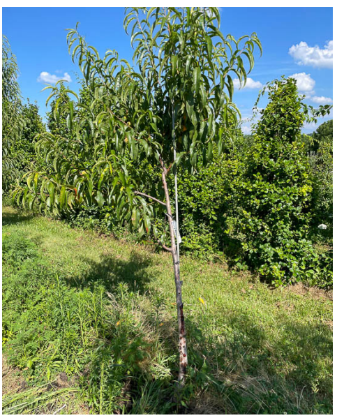
Peachtree borer damage on peach.