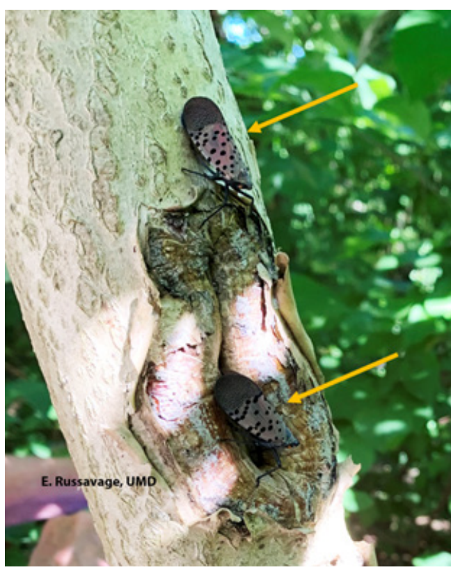
Two spotted lanternfly adults found on July 11, 2024 in Columbia, MD. feeding on the edge of a tree wound on tree-of-heaven.

If you see SLF adults, please let Stanton (sgill@umd.edu) and I (pshrewsbury@umd.edu) know.