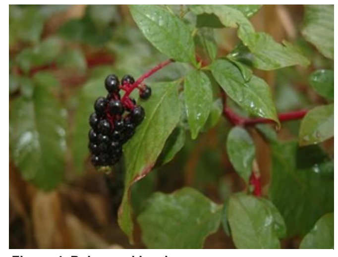
Figure 4. Pokeweed berries.