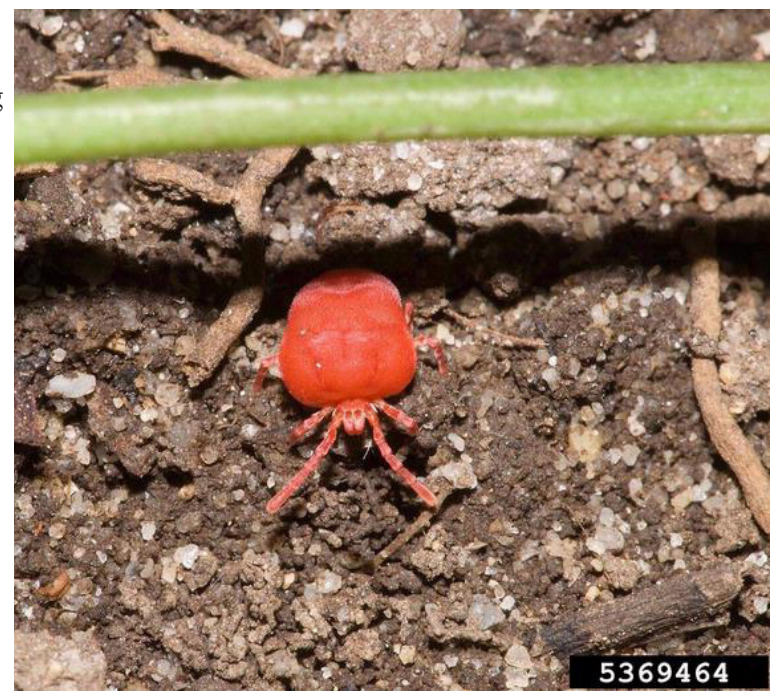
Chigger mite

Chiggers are thriving with this hot weather, punctuated with heavy rainfall in 2024. We had a couple of e-mails last week on nursery owners being bitten by chiggers. Dealing with chigger bites is no fun and results in sleepless nights from the itching. If dislodged from the host, chiggers die quickly, but the irritation and itching continue for several days. You end up scratching into the wee hours of the night after an attack. If dislodged from the host, chiggers die quickly, but the irritation and itching continue until the body neutralizes the saliva and repairs the tissue damage. The fluid oozing from the wound solidifies into a hard "cap" which is distinct for chigger bites and not other arthropods. Spraying to control chigger populations in infested areas has limited effectiveness and gives temporary control of only a few days or weeks, depending on environmental conditions. Still, after you have been bitten many times, the tendency is to get revenge by spraying the area. Once the area is mowed, then chigger problems tend to drop down significantly.