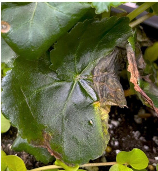
Fig. 2. Closeup of begonia leaf with bacterial leaf blight.