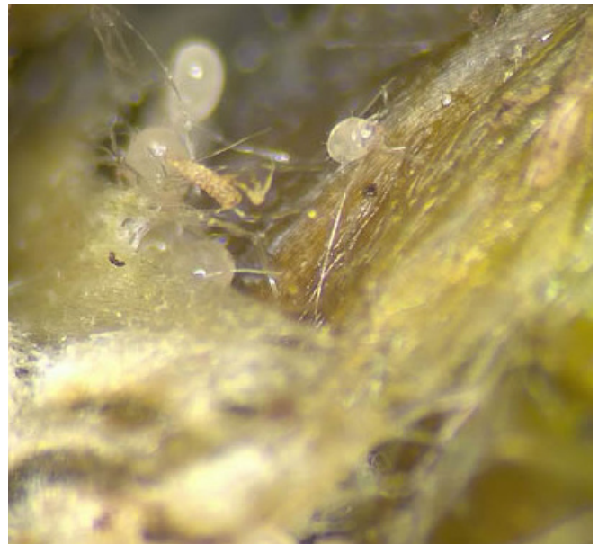
Bulb mites are feeding on the roots of gerbera.

Last month, we received Easter lilies that were infested with bulb mites. This week, the grower brought in gerberas that were also infested with bulb mites. Bulb mites are generalist feeders which can be found on a wide host range of plants. Bulb mites feeds on soft tissue. Keeping substrate on the dry side can help reduce the mites. Stratiolaelaps scimitus (formerly Hypoaspis miles ) are mites used for biological control. If rot is in bulbs, the mites will spread the problem.