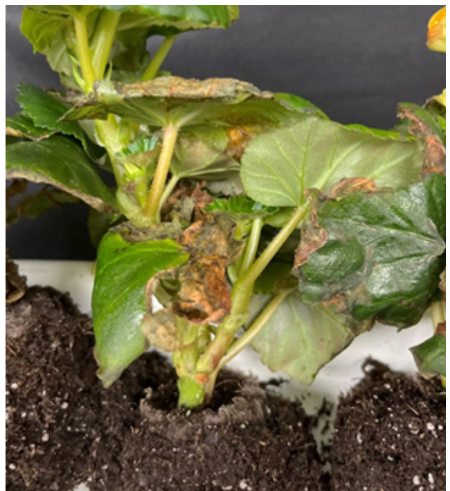
Fig. 3. Begonia with severe symptoms of bacterial leaf blight.