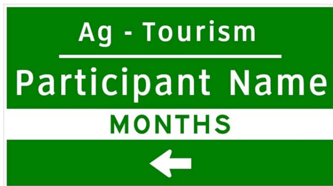
Figure 1 –Ag-Tourism Mainline Sign

MDA and the SHA have approved the Ag-Tourism highway sign design shown in Figure 1 below. The costs for new and replacement signs will be borne by the Ag-Tourism Facilities that meet the program criteria and are approved for signing.